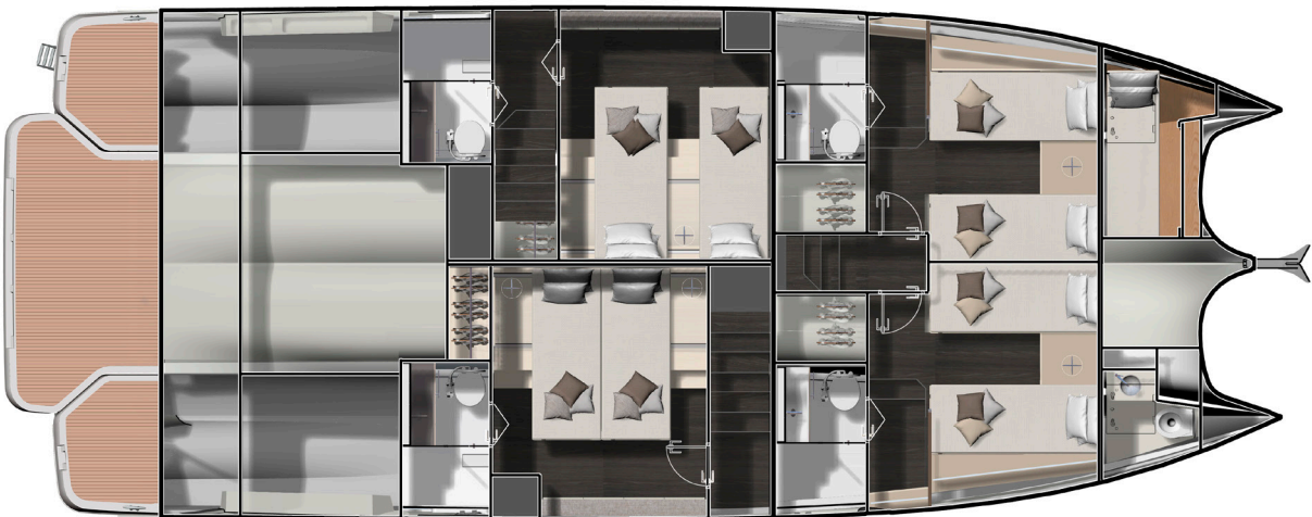
4 staterooms / 4 bathrooms